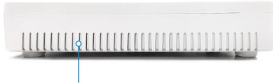
Side Cooling Vent