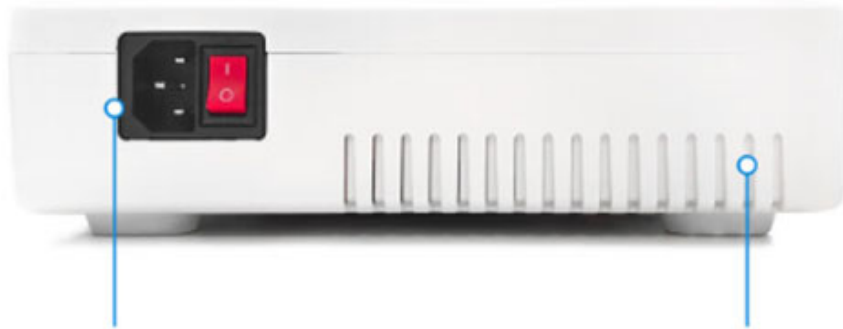
Power Socket & Switch